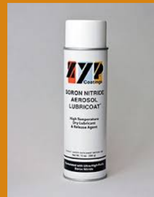
Boron Nitride Mold Release